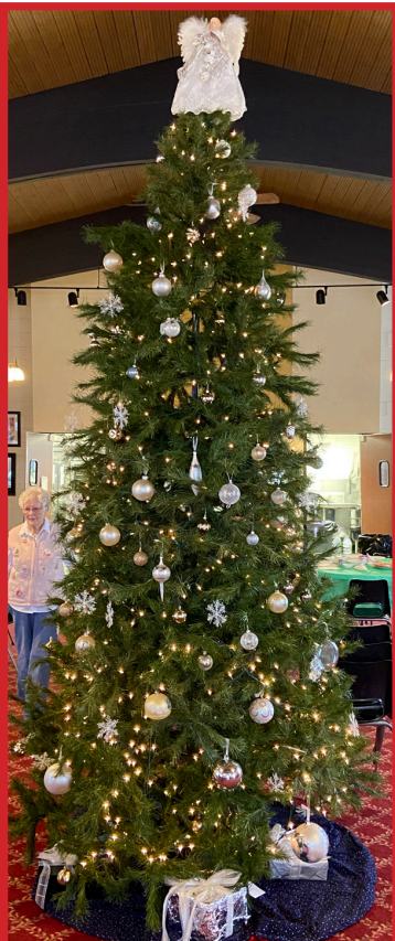
Fellowship Hall is dressed for Christmas!

Christmas Eve service starts with music at 4:30!